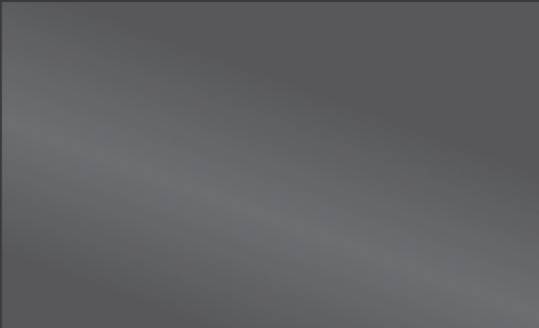
3M Color Stable Automotive Window Films