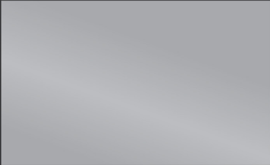
3M Crystalline Automotive Window Films