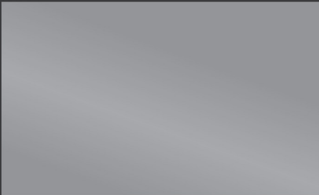
3M Crystalline Automotive Window Films